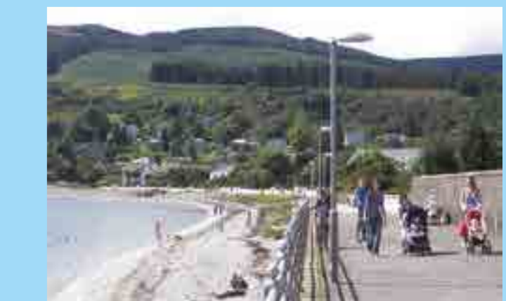
Dunoon West Bay